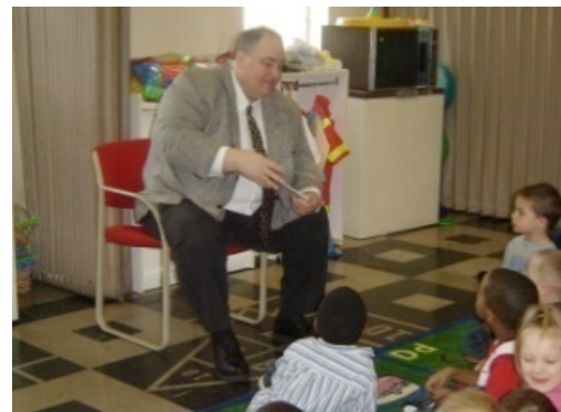
Rep. Pallone Reads and Celebrates the Month of the Young Child

“Ninety percent of brain development occurs by the age of five.” – PA Promise for Children